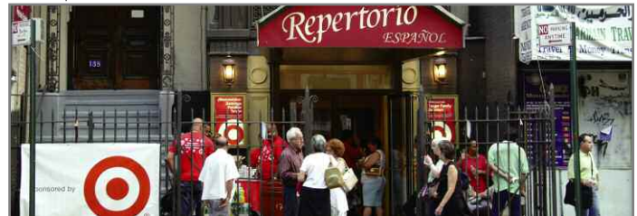
TARGET $1 SUNDAYS KICKOFF EVENT

What remains the most satisfying is the phenomenal response. Each Target $1 Sunday performance continues to reach 100% capacity. Audiences leave with a sense of enjoyment, engagement and appreciation. The feedback we receive is a deep and genuine appreciation and recognition for the opportunity Target $1 Sundays provides.